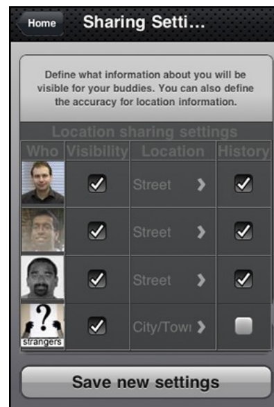
Figure 9. BuddyTracker selective disclosure features

Our case study took a dozen functional requirements of BuddyTracker to analyse the composition to the selective disclosure privacy norms defined earlier. We also implemented the logged events (both contextual information and the preference changes) during runtime for an offline analysis because currently the decreasoner reasoning module only supports a Linux command line interface. Using the logged events, we found that decreasoner can reveal whether the selective disclosure norms, adapted to the preferences specified by individuals, are violated or not. This finding gives us confidence that our formalisation of privacy requirements and arguments can provide useful information regarding the runtime satisfaction of privacy. Therefore we plan to integrate decreasoner into a common gateway interface so that the reasoning system can be accessed at runtime.