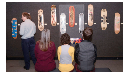
Skateboard decks designed by students and community members will be displayed in SC4's Fine Arts Galleries beginning Nov. 7.