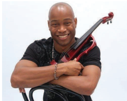
From Bach to Hip Hop with violinist Rodney Lamar Page comes to the Fine Arts Theatre on Feb. 19.

Classically-trained violinist Rodney Lamar Page uses his energetic style to bridge various styles of music in an unforgettable celebration of Black History Month.