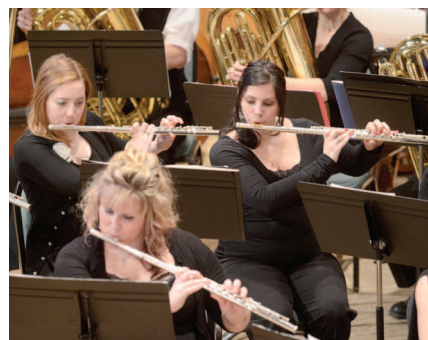
The SC4 Symphonic Band and Jazz Band will entertain audiences at concerts in October, December, February and April.