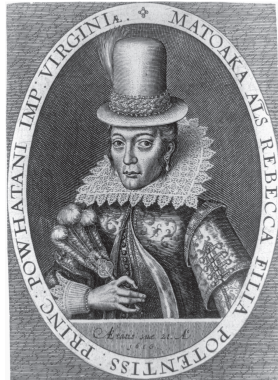
Matoaks als Rebecca daughter to the mighty Prince Powhatan Emperour of Atanoughkomouck als virginia converted and baptized in the Christian faith, and wife to the wor. M. Joh. Rolff.