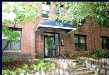
(Click on the Photo to View the Virtual Tour)

Estimated property tax and non-tax charges in first fiscal year of ownership is $3,901.24.