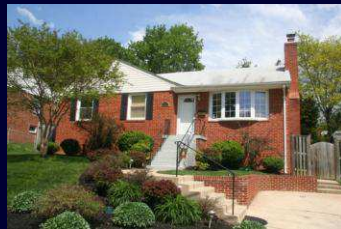
(Click on the Photo to View the Virtual Tour)

$425,000 10705 Francis Drive Silver Spring, MD 20902