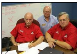
MARS MOU p. 5