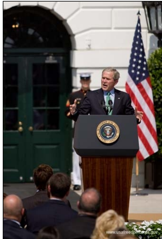
photo below.

Yes, I did, and it was terrific. Our assigned seat was near the center front (third row from the front, fourth seat from the center aisle). You can see the back of my head in some of the media photographs. See me in the bottom left corner of the