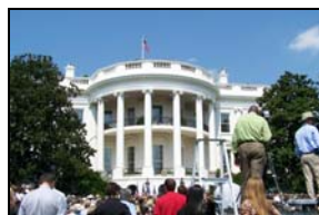
Visit to the White House p. 4