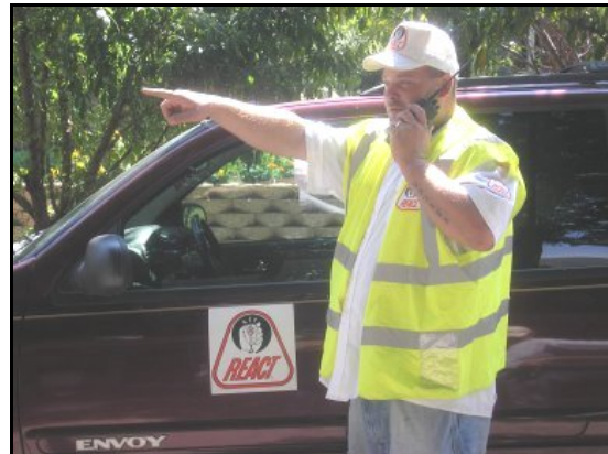
Teams and Team Members p. 10