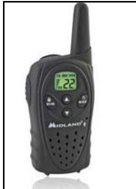
1-2-3 p. 3