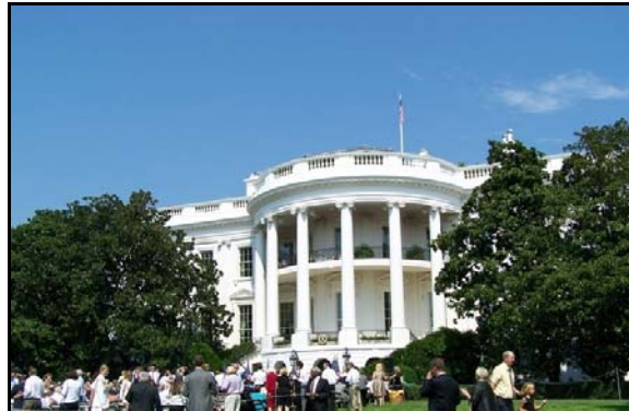
White House visit p. 4