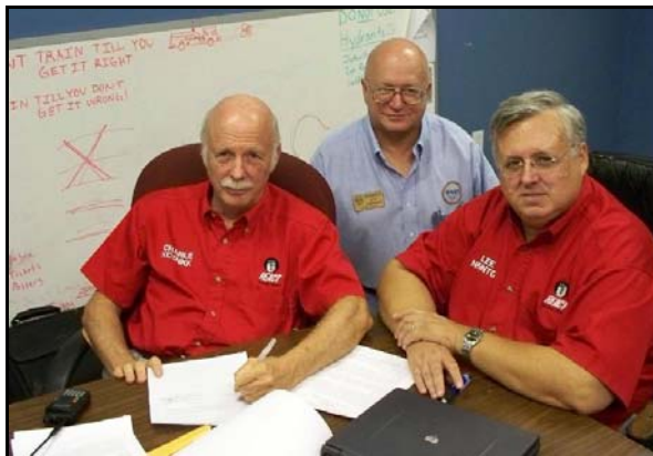
MARS MOU p. 5