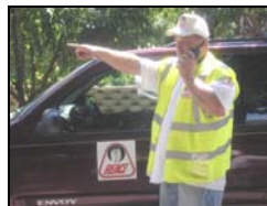
Teams and Team Members p. 10

The REACTer (ISSN 1055-9167) is the official publication of REACT International, Inc., a nonprofit public service corporation. © 2005 RI. All rights reserved. Mailed at Periodicals Rate at Suitland, MD, and other mailing offices. POSTMASTER: Send address changes to REACT, 5210 Auth Rd., Suite 403, Suitland, MD 20746-4393.