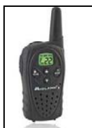
1-2-3 p. 3