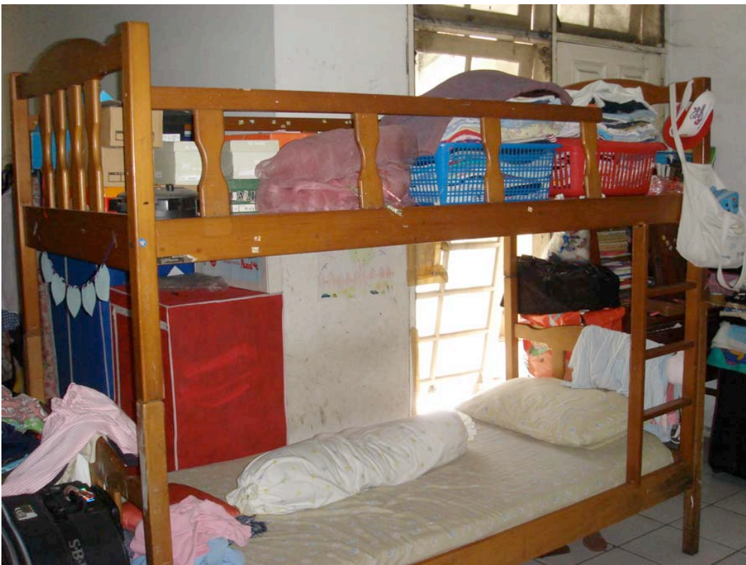
1.02: All the orphans sleep on bunk beds