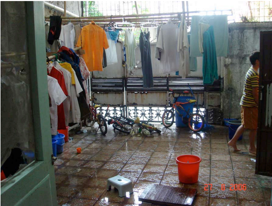
3.03: The orphans have to wash their clothes by hand and hang them dry