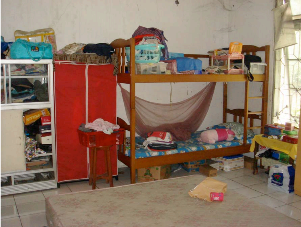
1.01: A portion of the girls' room