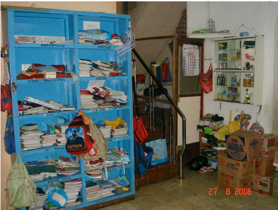
3.04: Each orphan has an assigned shelf to put their books and other school belongings in