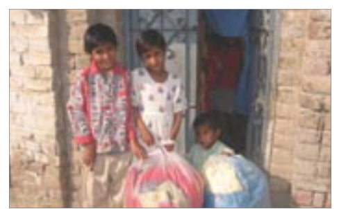
Orphans given items in preparation for winter

Today's job market requires skills which are typically not taught by the educational institutions in economically depressed areas. Hidaya prepares underprivileged graduates for the job market by offering services such as language competency training to boost communication skills and CV/ Resume writing tips and techniques. Seminars on essential job skills such