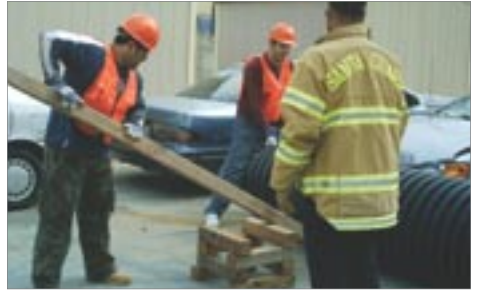
DPT members in a training excercise

By coordinating with local fire and emergency departments, Hidaya arranges disaster preparedness training