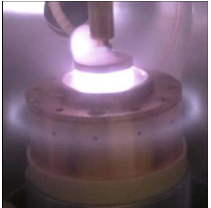
Laboratory test of a liquid-metal cathode.