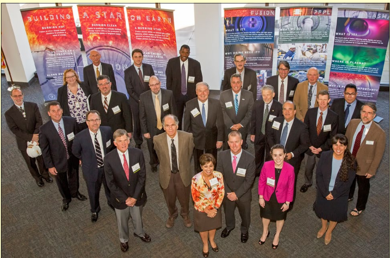
A group photo of members of the Cornerstone group along with PPPL managers and Princeton University guests in the Commons. Science Education and Best Practices and Outreach's new PPPL traveling display can be seen behind them.