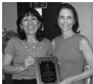
Rayburn Elementary Winning School

Hobby Middle School Holy Spirit Catholic Huebner Elementary Incarnate Word High School Jordan Middle School Kriewald Elementary Rayburn Elementary Rhodes Elementary Rudder Middle School Schulze Elementary Southwest Elementary St. Anthony Catholic St. Benedict Catholic St. Paul Catholic Steubing Ranch Elementary Stone Oak Elementary Terrell Wells Middle School Valley Hi Elementary Windcrest Elementary Woodstone Elementary Wrenn Elementary