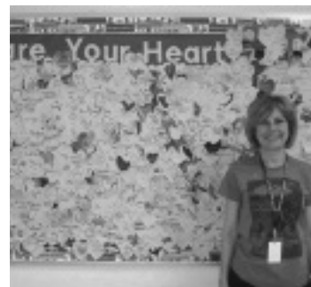
Bellaire Elementary School