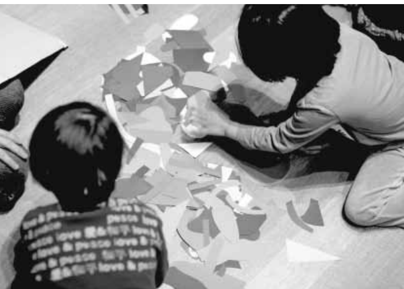
A Closer Look for Kids tour.

No preregistration. Tickets are distributed on a first-come, first-served basis in the Education and Research Building (4 West 54 Street, near Fifth Avenue) starting at 10:00 a.m. Programs often fill up; we recommend arriving a little before 10:00 a.m. Tours depart from the Education and Research Building lobby at 10:20 a.m.