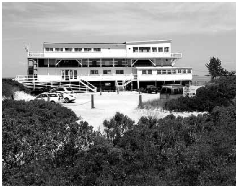
The Art Barge.

Online courses are made possible by a partnership with Volkswagen of America.