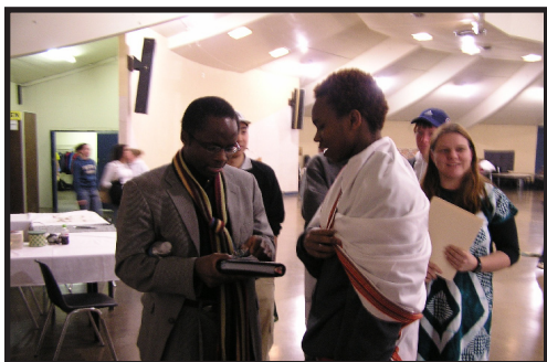
Mark Mathabane, author of Kaffir Boy , was one of the highlighted speakers at the 2006 ninth grade Pan African Conference held at the Wheeler Pavilion at the Lane County Fairgrounds.

The tenth grade Eurasian Conference has been a longstanding tradition in Eugene IHS bringing tenth graders from all campuses together for a day of cultural experience held at the Wheeler Pavilion at the Lane County Fairgrounds.