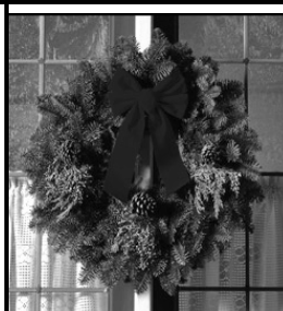
22" MIXED EVER-GREEN WREATH $21