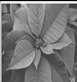
POINSETTIAS in 4 Choices: Red, White, Pink, and Marble

Order fresh Poinsettias and Greenery Now for delivery the week after Thanksgiving