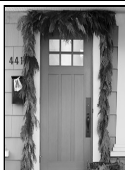
Western Cedar Garland $20