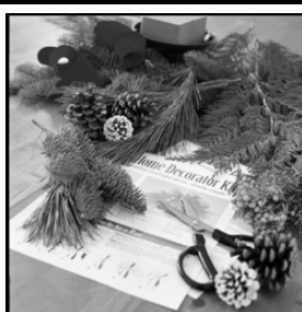
DECORATOR KIT $12.50