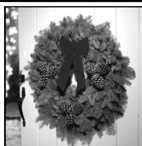
28" NOBLE FIR WREATH $32