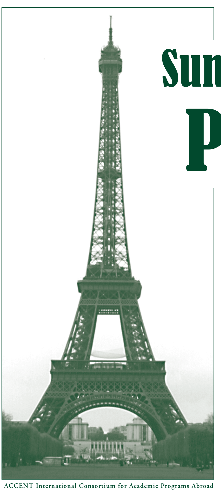
Summer in PARIS PARIS France