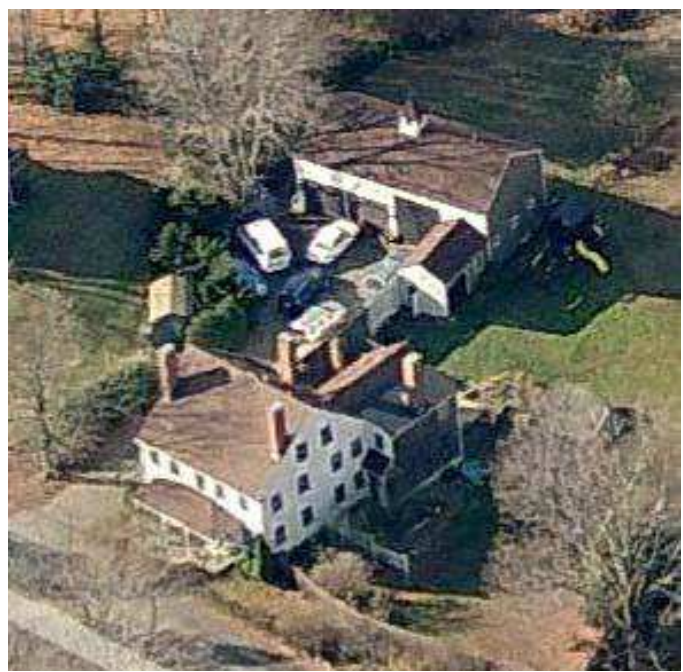
Aerial view from NE