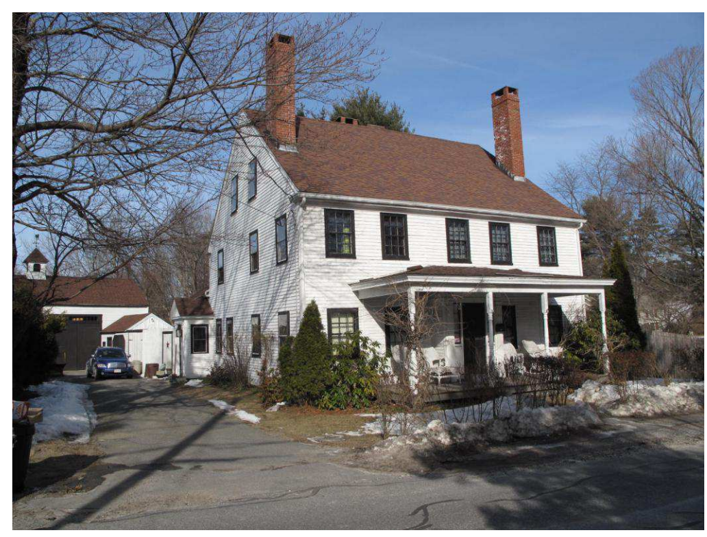
View from SE