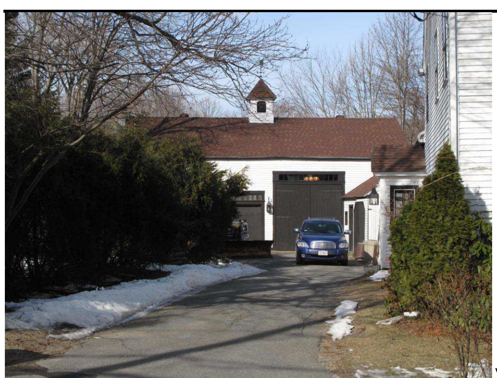
View from E