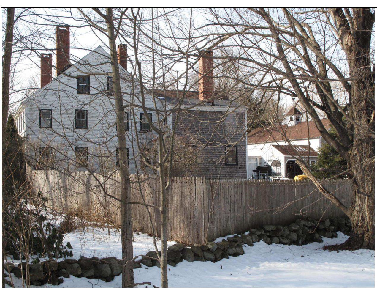
View from NE