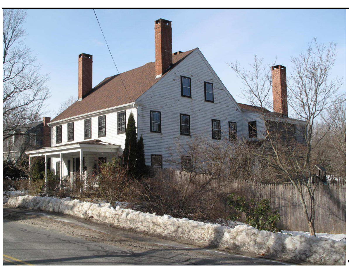
View from NE