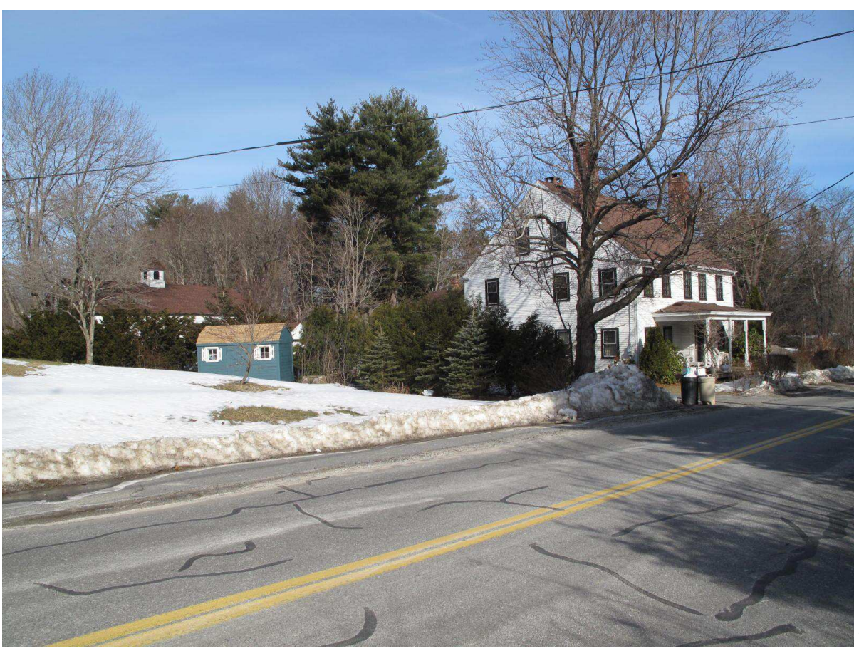
View from SE