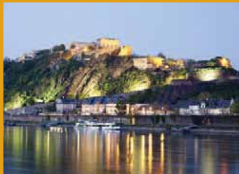
Ehrenbreitstein Fortress in evening light with painterly reflections in the Rhine River, Koblenz

† Provided for Air Program participants only.