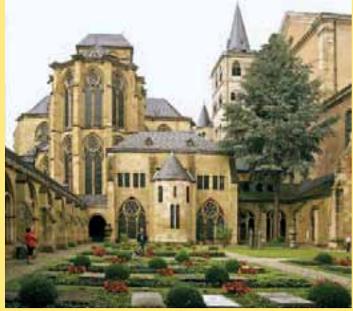
St Peter's Cathedral and gardens, Trier