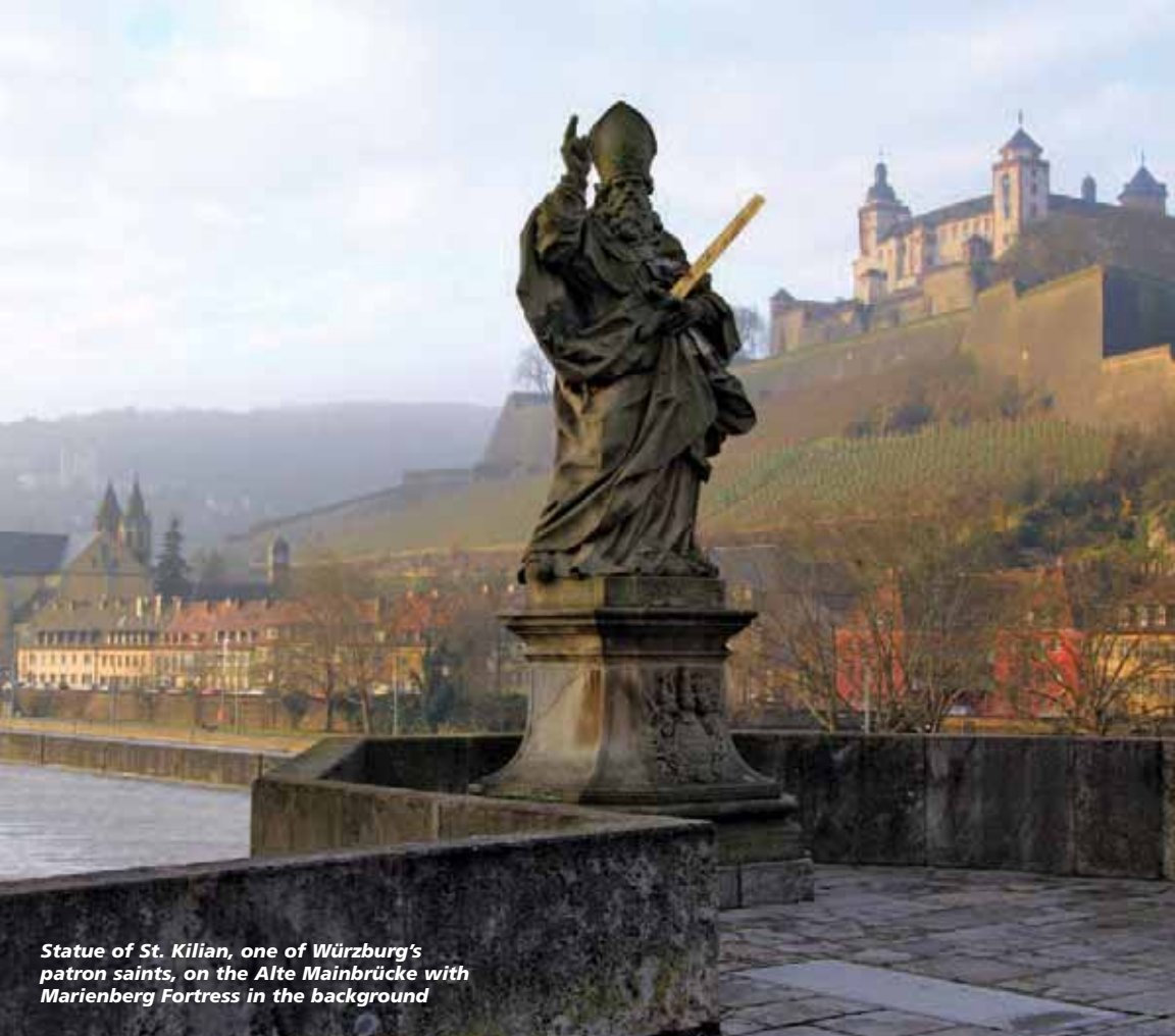
Statue of St. Kilian, one of Würzburg's patron saints, on the Alte Mainbrücke with Marienberg Fortress in the background