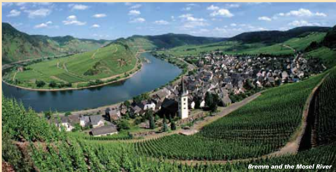
Bremm and the Mosel River

Spend seven nights cruising Germany's storied waterways to celebrate the culture of the country's most famous wine regions while exploring historic towns and storied scenic areas. Spend your days meeting local wine makers, admiring Roman ruins in Trier, appreciating the medieval architecture of Bernkastel and Rothenburg and visiting castles in Cochem and Heidelberg. This and so much more awaits you as you enjoy your passage to the villages and vineyards of the Rhine, Mosel and Main rivers.