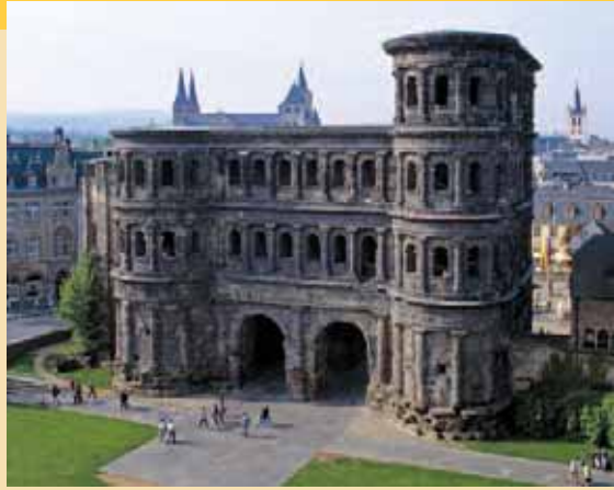
Porta Nigra, Trier

82 acres along the Rhine River and employs natural cultivation methods.