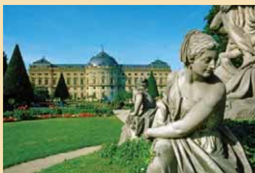
The Residenz, Würzburg

Valley wine. Follow with a wine tasting as you cruise along the river past the Loosen vineyards.