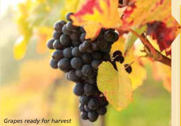
Grapes ready for harvest