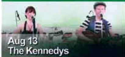
Aug 13 The Kennedys