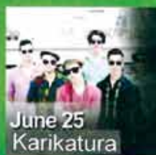
June 25 Karikatura