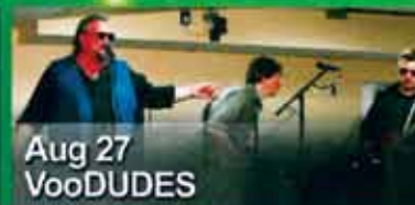
Aug 27 VooDUDES

Inclement Weather Hotline (732) 602-6045