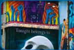
June 30 Broadway at your Door Step

Enjoy great music "Under the Stars" and "On the Lawn" at Woodbridge High School. Every Monday night in July and August. FREE ADMISSION WITH NON-PERISHABLE FOOD ITEMS FOR "WE FEED WOODBRIDGE" FOOD BANKS. Bring your lawn chair or blanket... Relax and enjoy the Mayor's Summer Concerts. SHOW TIME 7:30 PM