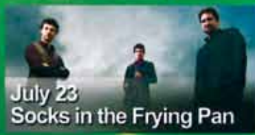
July 23 Socks in the Frying Pan