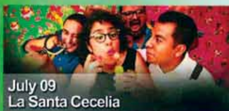
July 09 La Santa Cecilia