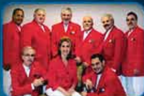
July 23 Cameos

Inclement Weather Hotline (732) 602-6045