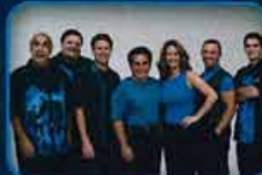
August 18 The Fabulous Greaseband