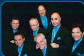
July 21 Jersey Sound