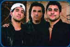
July 07 Bronx Wanderers