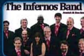
August 25 The Infernos