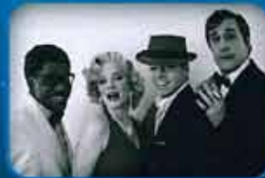
August 04 NY Rat Pack