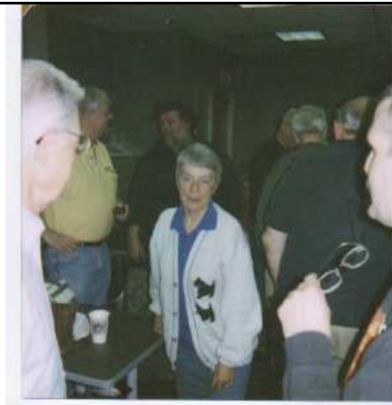
Break time at April 8, 2005 meeting.