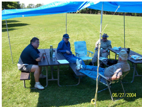
Field Day activities for 2004, some times you operate and other times you catch up on the local happenings.