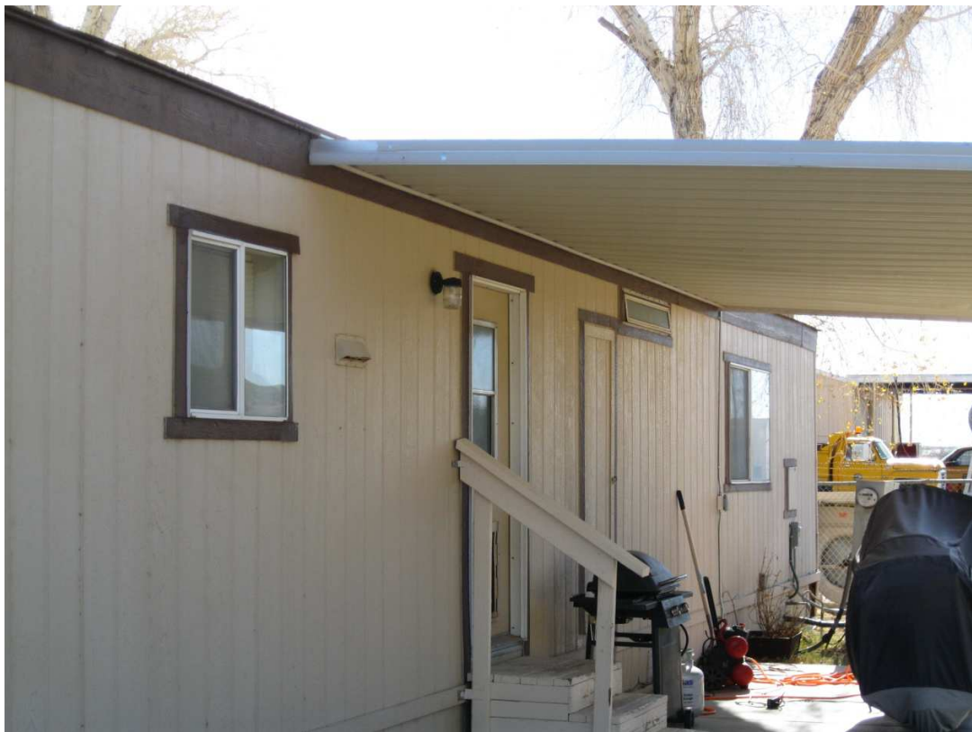
Shoshone Modular, showing windows and shade awning