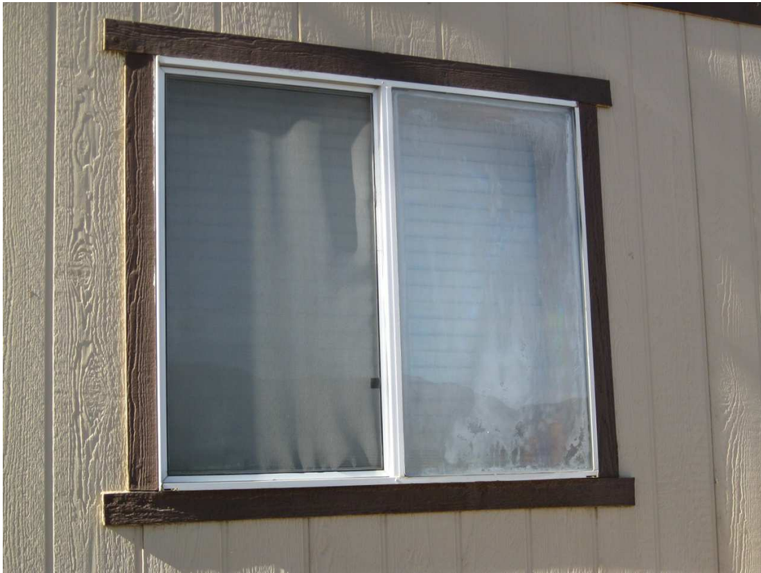
Typical window installation