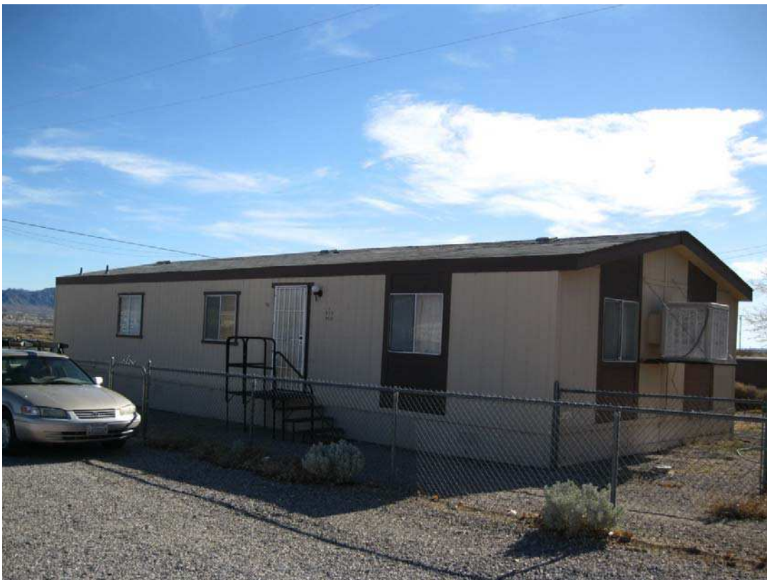
Shoshone Modular, showing windows and existing roofing

SHOSHONE MODULAR BUILDINGS IMPROVEMENT PROJECT