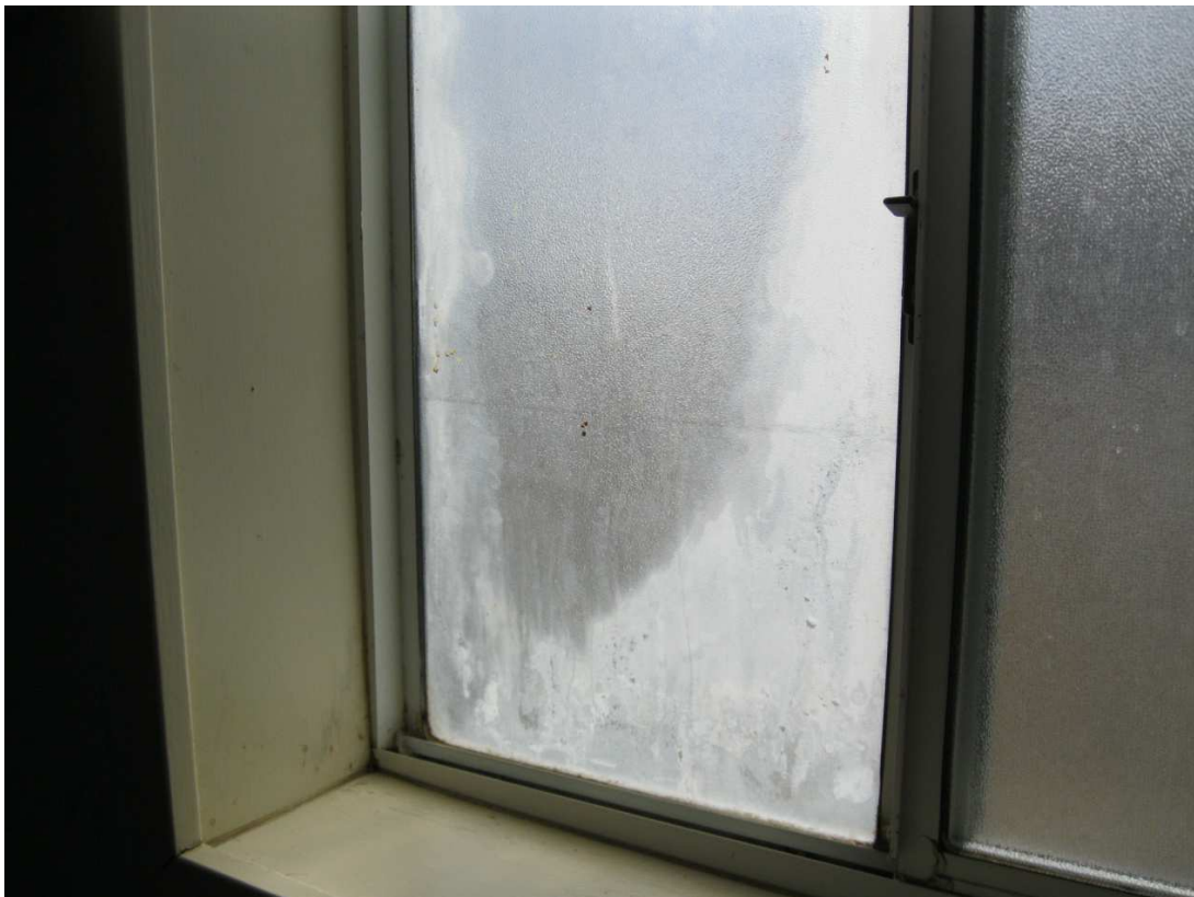
Additional photos available upon request

SHOSHONE MODULAR BUILDINGS IMPROVEMENT PROJECT