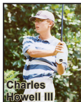
Charles Howell III