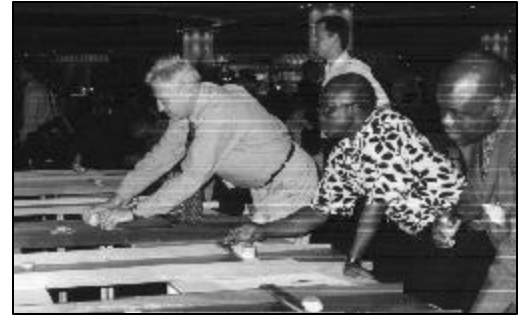
Serious fun at the post-poster party, “Wednesday Night Fever”