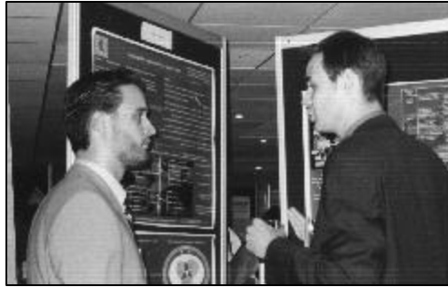
Serious discussion at the poster session

“IAIA meetings are getting better and better!”