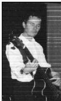
Can you identify this rock star? See answer below.

Before the conference officially began, IAIA’02 delegates were meeting new people, renewing old acquaintances, and learning more about impact assessment in The Netherlands by participating in one or more of six technical visits. Delegates enjoyed the opening reception at Madorudam, a miniature “city” with all famous Dutch landmarks rebuilt at a scale of 1:25. “IAIA’02 succeeded admirably in enabling participants to make their own connections—of people and ideas,” said delegate Trevor Blake of Australia.