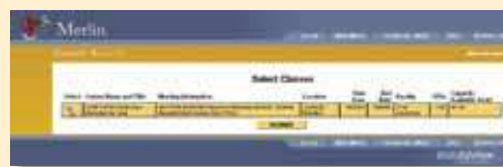
Illustration of step 5.