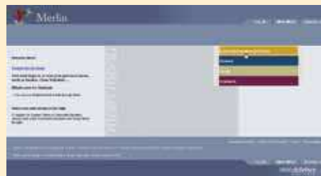
Illustration of step 2.