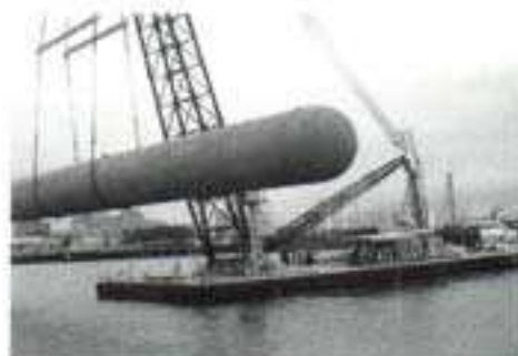
Harbor Service/Derrick Barge