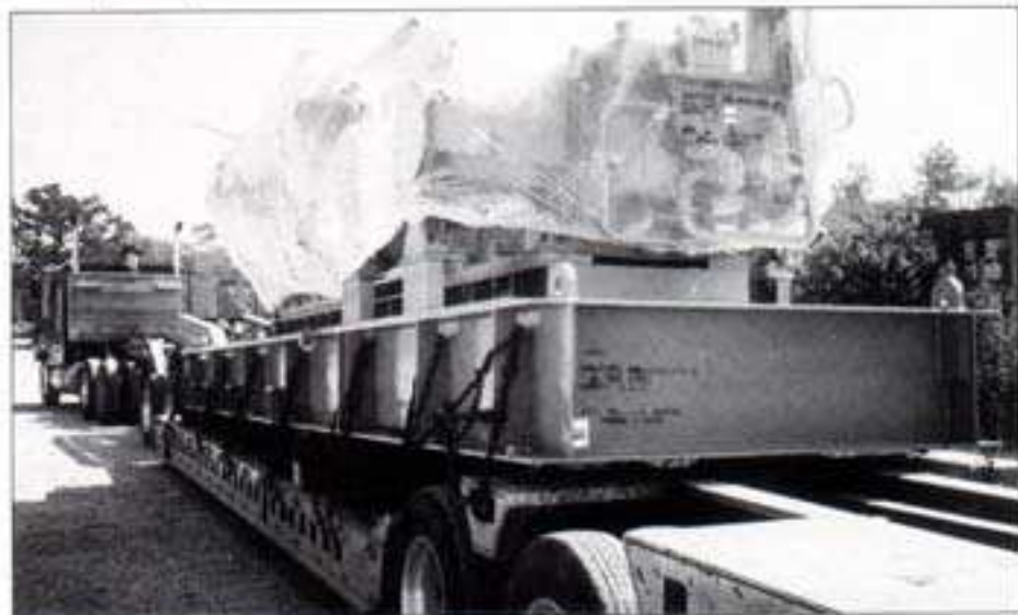
A new packaging method, using a high-strength plastic wrapping, was employed to package a variety of components shipped recently to the United Arab Emirates. Lee's Material Services of Houston was export packer for the project.

Maersk Lines was the ocean carrier for the project, and Krenmerich Shipping Company was the forwarder.