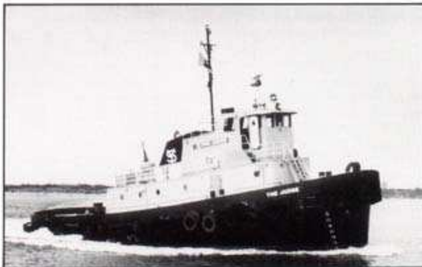
Suderman & Young tug "The Judge"

The Riviana Building, Suite 918, 2777 Allen Parkway, Houston, Texas 77019 • (713) 529-9944 • FAX: (713) 529-2924 HOUSTON • GALVESTON • TEXAS CITY • FREEPORT • CORPUS CHRISTI