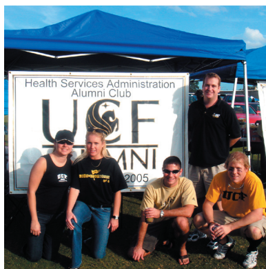
Health services administration alumni celebrated UCF Homecoming and cheered the Golden Knights on with a tailgating party at the Nov. 6, 2005, UCF vs. Houston game. They also participated in the 2005 Homecoming Parade.