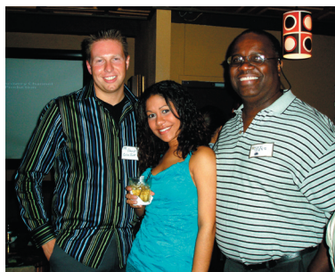
The Health Services Administration Alumni Club joined efforts with the Criminal Justice and Legal Studies Alumni Club to offer a fall social and networking event on Oct. 19, 2005, at Rhythm and Flow in Orlando.