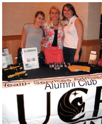
The Health Services Administration Alumni Club greeted UCF health services administration alumni at the FAIRWINDS Alumni Center Open House on Nov. 5, 2005.