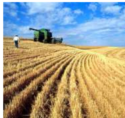
Wheat... need I say more?

Most of us need to go into Spokane every now and then so I'm asking the clubs now to look at these training dates when they come out and stress the importance of this training for next year's new officers in 2015. Contact me if you have any questions about officer training. -ZC Rob