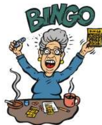
Davenport Lions have a huge fundraiser in November that funds ALL their projects for the year.