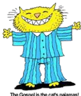
The Gospel is the cat's pajamas!

Friday Fun Night "Pajama Party at the Beach" - Think Flannel!