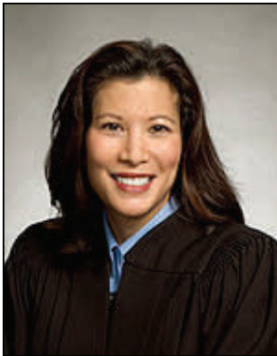
Hon. Tani Cantil-Sakauye Chief Justice California Supreme Court