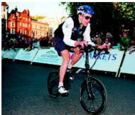
THE 2012 LBP AWARDS

The new carbon model is built on Dahon's patented Dalloy Hydroformed aluminum frame, build-up includes some unique parts.