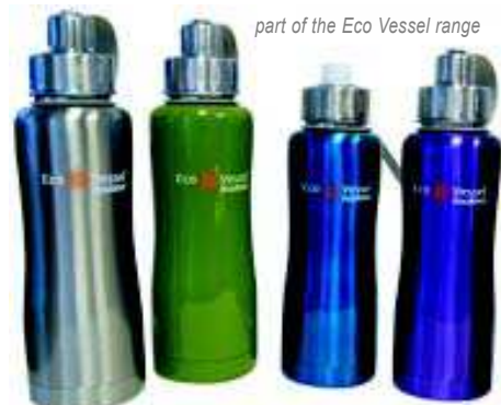
part of the Eco Vessel range

www.whitbyandco.co.uk www.ecovessel.co.uk