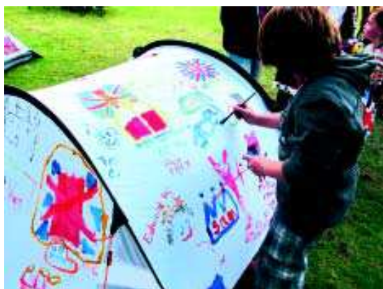
grandchildren amongst those making their mark at Sandringham