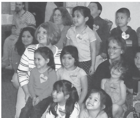
Children from Storm Lake's Head Start Program visit Lakeview Manor to each receive a blanket made by residents participating in Project H.A.N.D.S.™