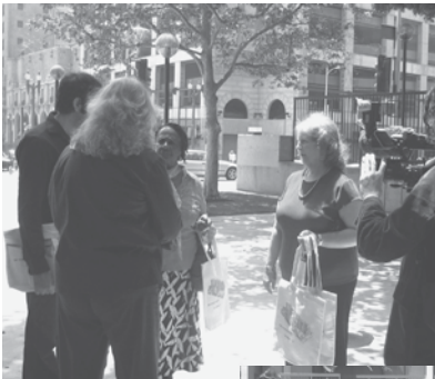
RHF staff greet the BBC film crew and members of The Zimmers and take them on a tour of Angelus Plaza - the "city within a city."