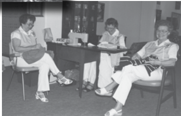
Right - "Pinafairs" on duty, sewing.