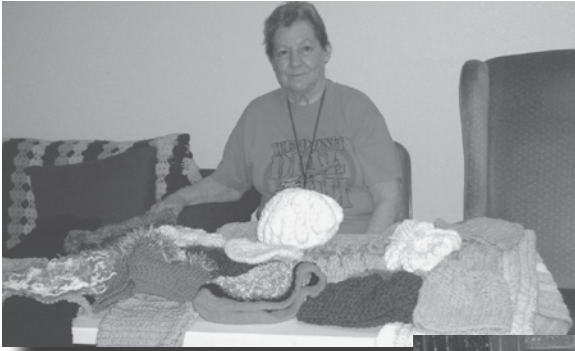
Project H.A.N.D.S. TM volunteers from 300 Main (Estacada, OR - left), Cardosa Village (Sacramento, CA - right) and St. Catherine (Florissant, MO - below) showing off their handiwork.