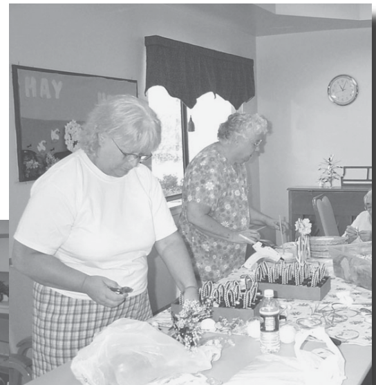
Mill Pond Manor residents hard at work. Their items are donated to Graylings, Michigan's home for displaced mothers.