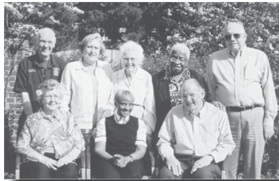
(Left) The Carlin (Arlington, VA) Senior Flower Club Committee makes sure that residents facing tough times have flowers to brighten up their day.