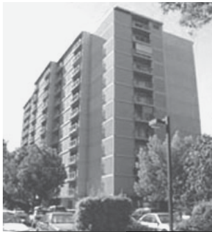
Above - Pioneer Tower