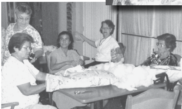
Residents at La Mirada Vistas (La Mirada, CA) meet weekly to create quilts and crochet items for the local Women and Children Shelter.