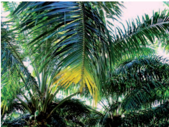
Figure 1 An oil palm frond (leaf) with leaflets showing Finschhafen disorder (FD) symptoms. Chlorosis begins at the tips and progresses towards the petiole.

be lost. A native PNG planthopper, Zophiuma lobulata Ghauri (Hemiptera: Lophopidae) has been implicated in FD because of its presence in relatively high numbers where the disorder is prevalent (Smith, 1980a; Prior et al. , 2001). Smith (1980b) showed that yellow-bronzing symptoms associated with FD were induced on 8-month-old coconut palms after holding Z. lobulata adults and nymphs in captivity together with potted coconut palms for 7 months. The disorder, however, affects both young and old palms (Prior et al. , 2001).