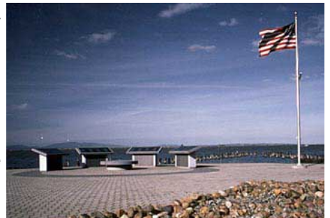
The Port Chicago Naval Magazine National Memorial honors the memory of those who gave their lives and were injured in the explosion on 17 July 1944 and recognizes all who served at the magazine.

in the Bay area was affected. Concord Naval Weapons Station was downsized and the 834th Army Transportation Battalion from the closed Oakland Army Base took over The Concord Weapons Station. The Army had two (2) container cranes built on