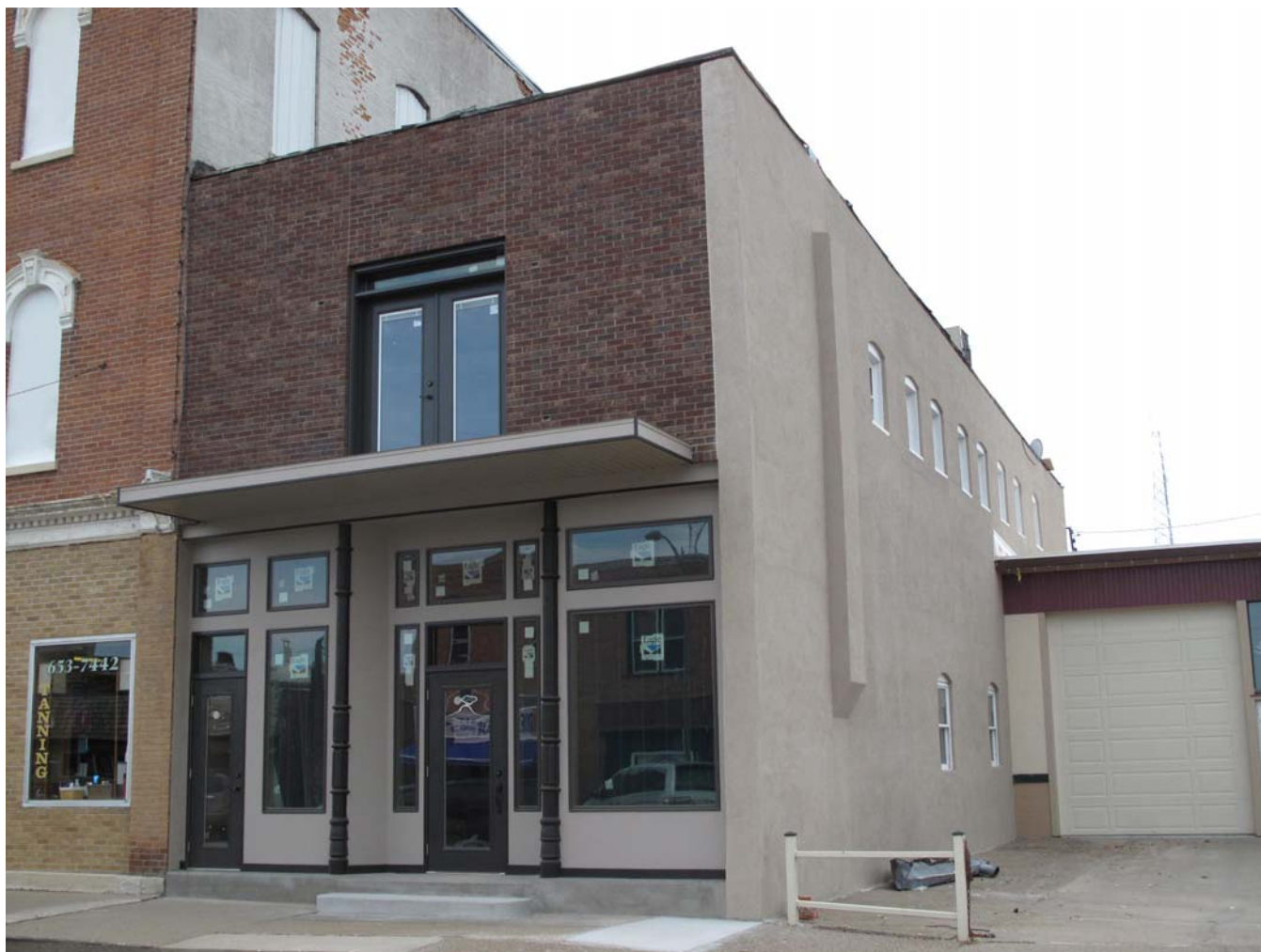
Photograph 92-00503-001 - East and north elevations, looking southwest