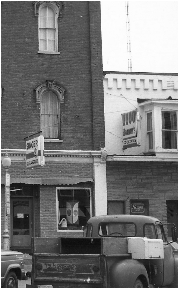
Edge of building in 1971 photograph (Wagner 1971)