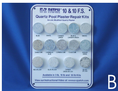
E-Z Patch 10 & 10 F.S. Color Sample Sign