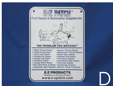
E-Z Patch Small Plastic Product Sign