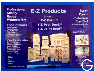
E-Z Patch Counter Mat