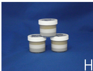
E-Z Patch 23 Jar of Color Samples