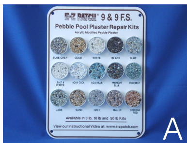
E-Z Patch 9 & 9 F.S. Color Sample Sign