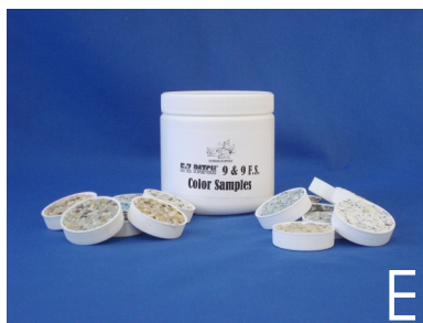
E-Z Patch 9 & 9 F.S. Jar of Color Samples