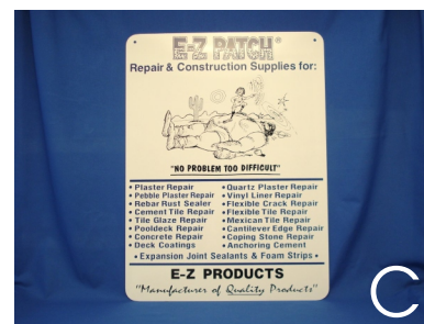
E-Z Patch Large Metal Product Sign