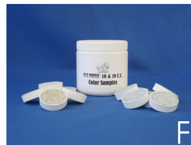
E-Z Patch 10 & 10 F.S. Jar of Color Samples