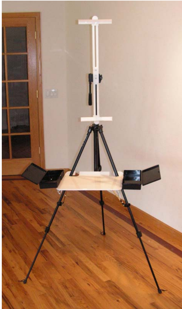
SunEden Tripod (03-01), Traveling Adapter (02-04), Artists Shelf (01-20), and two Side-Mount Accessory Boxes (01-12)