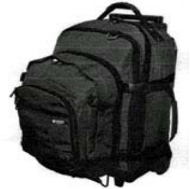
13-06. Rolling Art BackPac

13-01. Artist's StudioPac. Your studio in a backpack! Flatwork Compartment features dual zipper flip top which allows access to 19"x24" pads, canvases, etc. Dual zippered center compartment carries supply boxes and so much more! Twin outer compartments hold your SunEden Tripod or Easel, Tilting Adapter and Roll-A-Stool or Chair. Waterproof coated fabrics minimize bulk. Tough and indispensable for the artist on the move. Features adjustable shoulder straps to provide comfortable fit for every artist. Weighs 3.6 lbs.