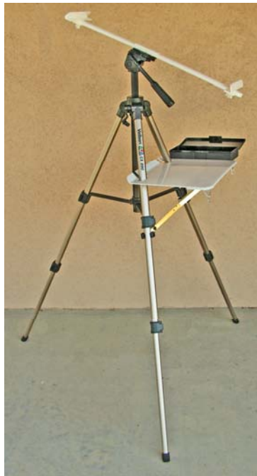
SunEden Heavy-Duty Plein Air Tripod with Traveling Adapter, Artists Shelf and Side-Mount Accesso-