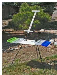
Pastel Painters Starter Package Item 20-34