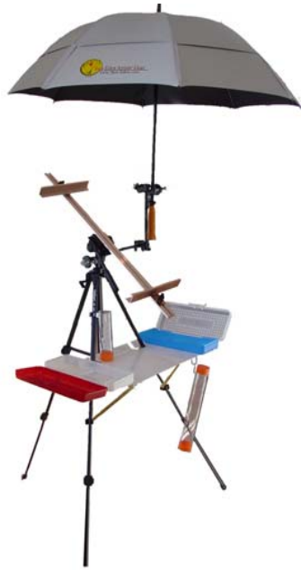
SunEden Tripod with Traveling Adapter, Artists Shelf, two Side-Mount Accessory Boxes and the Traveling ArtBrella Package.