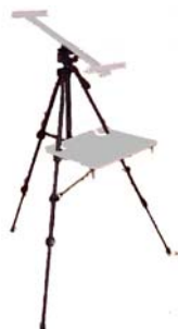
Lite-Weight Painters Startup Package Item 20-40