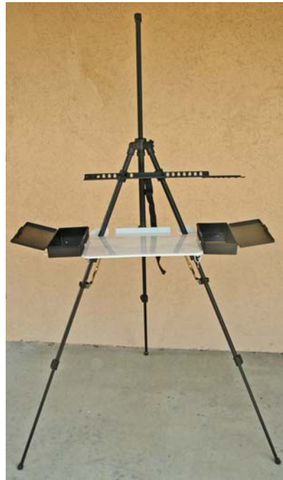
Colorado Easel shown with Artists Shelf and two Side-Mount Accessory Boxes.