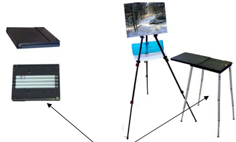
01-15 Traveling Art Table

01-15. Traveling Art Table. This indispensable work space sits beside your easel or tripod to hold your art gear. The non-skid table surface expands from 12" to 24" long by 10 3/4" wide. Four aluminum legs telescope from 13" to 30" tall and fit into the table bottom when not in use. Folds to 13 1/2"x10 3/4"x1 3/8" thick and fits easily into your backpack or tote bag. Weighs 3 lbs. Supports up to 18 lbs.