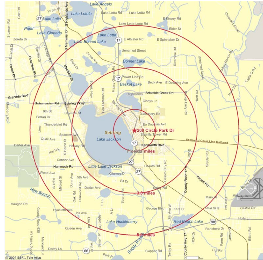
Sebring, Florida Retail Market Area

When thinking about what your vision is for your downtown, it is critical to remember that your Local Resident Shoppers = Sebring's Demographic Profile .