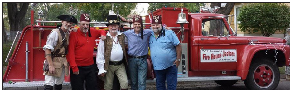
Firehouse Jesters getting ready for the La Crosse Torchlight Parade.

The official Notice of Zor's 2015 Annual Meeting and Election of Officers Zor Temple's Annual Meeting and election will be held Saturday, January 10, 2015 at the Zor Shriners Center in Madison. A total of 7 Zor officials will be elected and six members of the Appointive Divan named to posts during the election and post-election meeting and installation ceremony. This is the official notice required by Imperial Council: