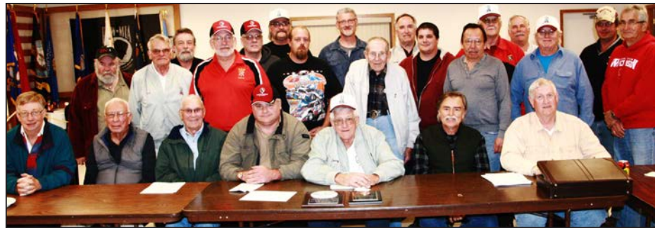
The Roadrunners season wrap up at the American Legion Club in New Richmond.

Zor's Clubs and Units have been busy this summer with lots of pictures to prove it. If you want your club or unit recognized in the Zephyr, please send your pictures with a brief caption to the Zephyr Editor: zorzephyr@tds.net or 1116 Spruce Drive, La Crescent, MN, 55947. Tell us what you are doing so we can share it with the rest of Zorland! If you don't show, we can't tell.