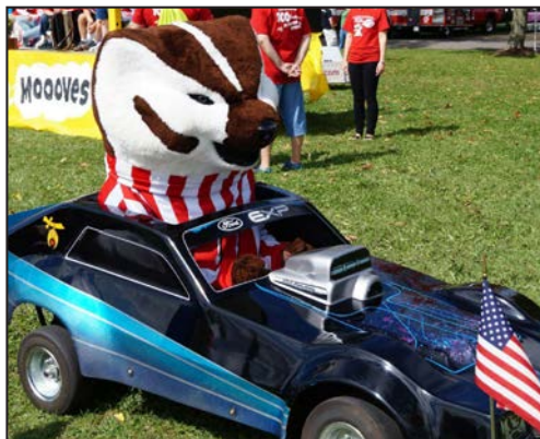
Bucky Badger checking out one of the Mini-cars vehicles at the Monroe Cheese Days parade.