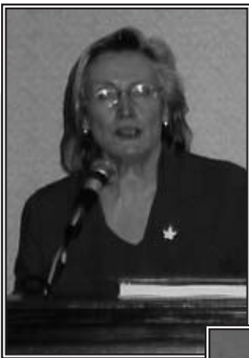
Dr Carolyn Bennett