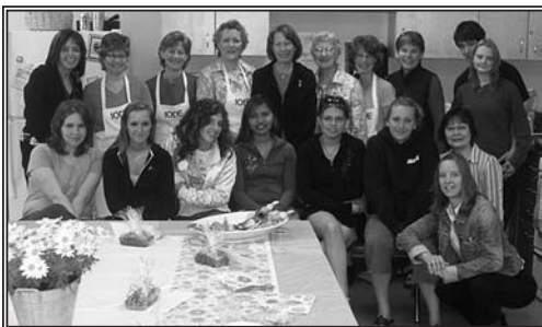
Richmond Chapter , Richmond, BC, hosted a Mother's Day Brunch for the Colts Young Parent and Transitions Program at Richmond High School. The IODE members can be seen wearing white IODE aprons.