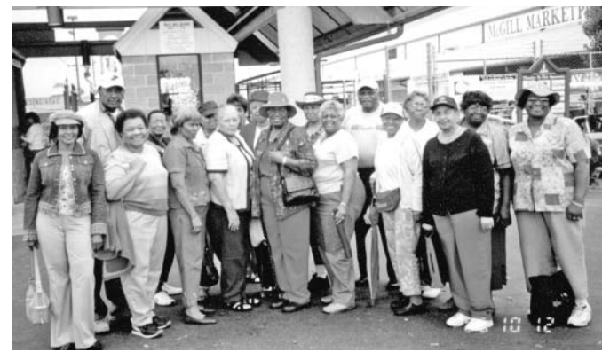
Peach Retired Educators group at the Georgia National Fair.