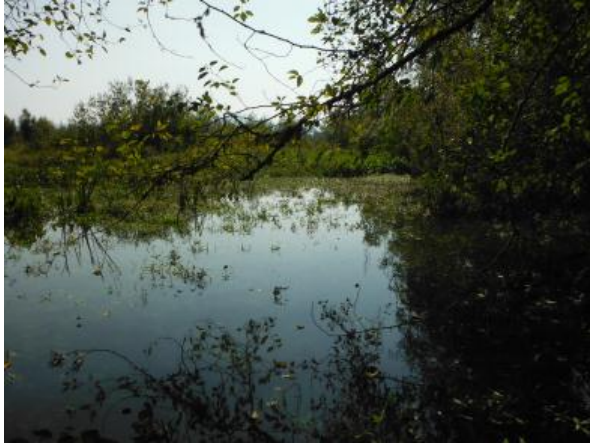
Shallow water pond located near the northern levee. This water would be reconnected to Prairie channel at elevations 5.0 (NAVD88) and above.