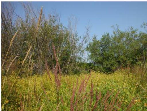
Vegetation along the northern levee (Elevation approximately 8 ft NAVD88)