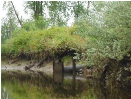
Collapsed tide gate at the former ferry landing plug. Photo taken on 7/19/2012 during an incoming tide. Water level was approximately 0.5 ft (NAVD88)