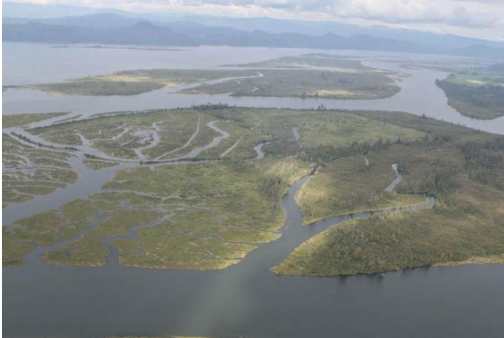
Aerial view of Karlson Island looking north