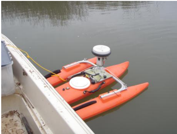
Acoustic Doppler Current Profile (ADCP) used to measure channel bathymetry and currents flow. April 12, 2012.