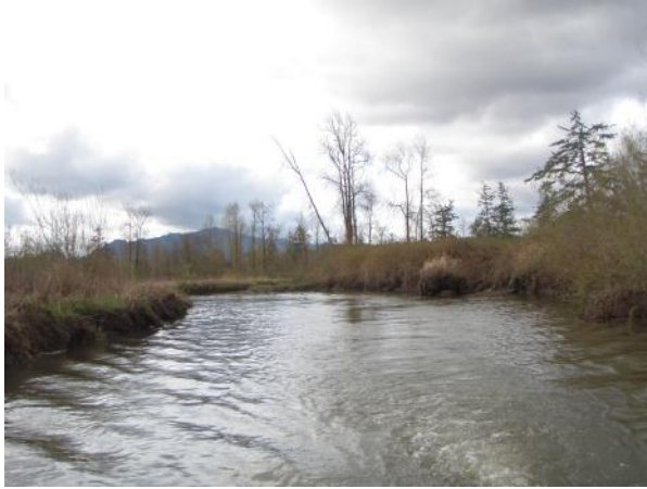
Interior slough on Karlson Island. Photo taken on 4/11/2012 during an outgoing tide looking south. Water level was approximately 5.0 ft (NAVD88)