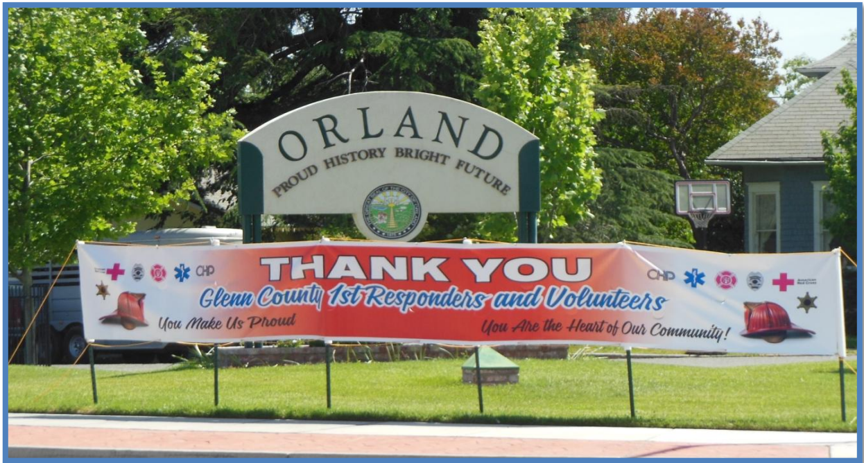
Glenn County First Responders and Volunteers come together in time of tragedy. April 10, 2014