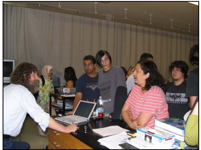
Dr. Robert Sapolsky at San Jose High Academy, San Jose.

“People frequently ask me why I devote so much time to seeking out facts about man’s past...The past shows clearly that we, all of us, have a common origin and that our differences in race and color and creed are only superficial.” – Dr. Louis S.B. Leakey