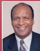
JESSE WHITE Illinois Secretary of State

♻️ Printed on recycled paper. Printed by authority of the State of Illinois. July 2012 — 105M — SOS DOP 141.10