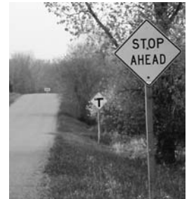
Warning sign prepares motorists to stop safely at hidden intersections.

Traffic signs are useless if motorists cannot see them in time to react. The most crash-critical example is the STOP sign. Be sure all STOP signs are visible and recognizable from a distance that allows drivers time to react.