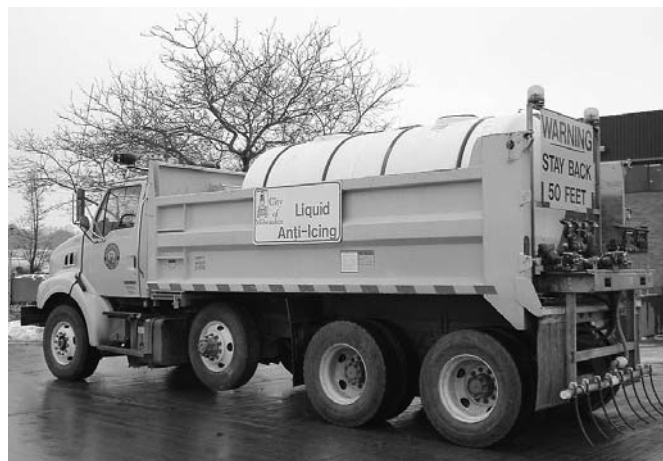
Many Wisconsin communities are adding pre-storm anti-icing equipment to their winter maintenance programs.