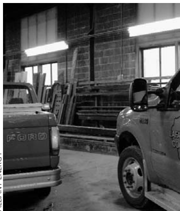
Main and storage garages are two to three times brighter with the new energy-efficient lighting.

Success with the lighting project inspired Jean to pursue other programs to update windows and heating equipment in the highway facilities. "We need to be creative in stretching limited resources to provide our community with a continuing high level of service," he concludes. "This experience is proof to me we can do it." ■