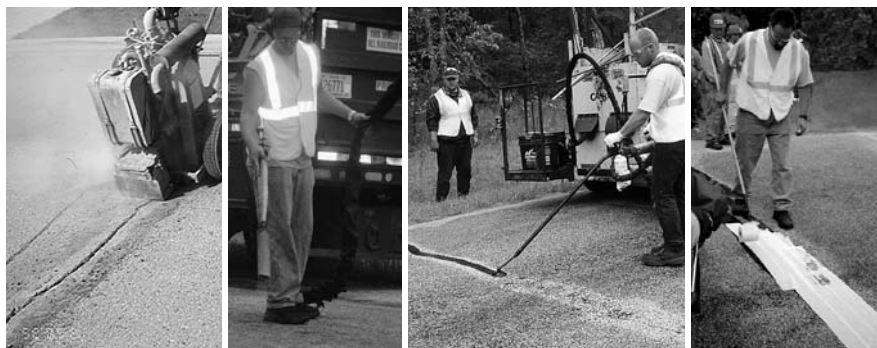
Crack seal process, LEFT to RIGHT, involves routing the crack, cleaning it, filling with sealant and shaping an overband, allowing the repair to cure, and blotting excess sealant with layer of fine sand or tissue.

Bill Glatz, Jr. Fahrner Asphalt Sealers 920-759-1008 bglatz@fahrnerasphalt.com