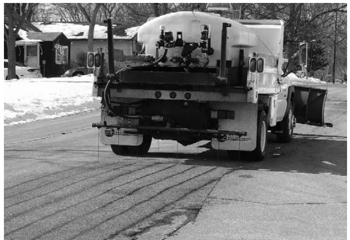
A truck equipped for anti-icing applies a liquid blend on a Beloit city street as a preventive ice and snow control measure.

Balancing safe winter roads with environmental cautions,