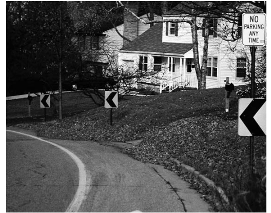
A bank of chevrons delineate a crash-prone curve.

vehicles pull off the to park, enter or leave a driveway, and stop at a mailbox. It may take more than routine shoulder maintenance to reduce trouble spots. Stabilizing or paving the shoulder on curves, on hills and along stretches of road with many driveways is a good solution. Temporary edge drops that happen before crews restore the shoulder after a road-resurfacing project also pose a problem. An effective immediate fix on new construction is a tapered section called the "safe edge" that reduces crash risk before crews complete their work on the shoulder.