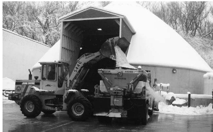
A spreader loads up at one of six salt domes that serve the City of Milwaukee street crews.

Purchasing road salt on a state contract they renew annually, the City of Appleton in Outagamie County paid $38 per ton this year compared to $33 per ton in 2007. Carl Schultz of the city's public works department says they committed to 5,000 tons with