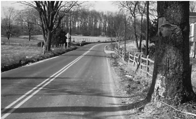
Large tree on the right, close to road, creates a crash risk.

Fixed objects make up 21 percent of all crashes and trees account for 15 percent of all fatal crashes. Owners of land adjacent to a right-of-way that has trees and other woody vegetation might object to a clearing project, but creating a separation between