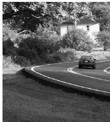
This severe edge drop poses a serious driving danger.

A sharp drop of more than two inches along the edge of a road creates a serious hazard if a motorist swerves out of his or her lane. At high speeds especially, the vehicle might leave the road and roll over. Edge drops often occur because of unstable and soft shoulders. They are common on the inside of a curve or where