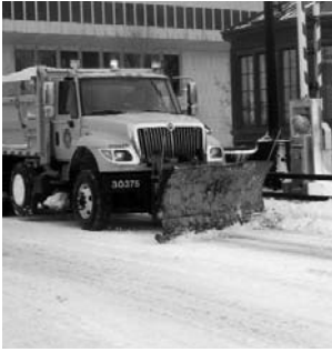
More frequent plowing is a good alternative to salt use.

Local officials responsible for maintaining city streets, and county and town roads report paying between $33 and $180 per ton for their supplies.