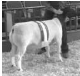
Res. Champion Dorper Ram Holman Dorpers, Texas