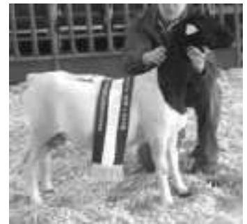
Res. Champion Dorper Ewe JBJ Livestock, Missouri