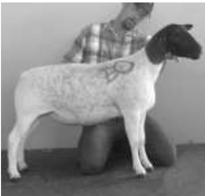
Champion Dorper Ewe Riverwood Farms, Ohio