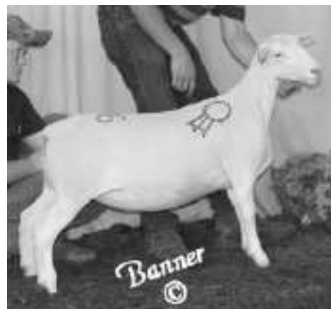
Champion White Dorper Ewe Riverwood Farms, Ohio

Champion and Reserve Champion White Dorper ewes from Riverwood sold for $1,500 and $1000 respectively