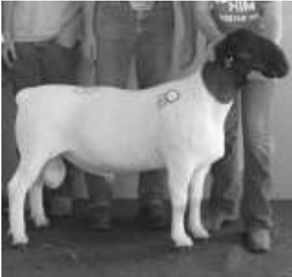
Reserve Champion Dorper Ram Half Circle Six Ranches, Texas