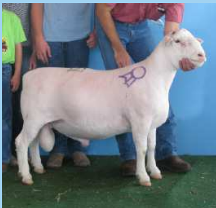
2013 National Champion White Dorper Ram