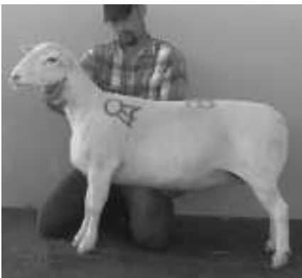
Champion White Dorper Ewe Riverwood Farms, Ohio