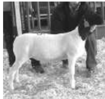
Champion Dorper Ewe Deer Run Ranch, Missouri