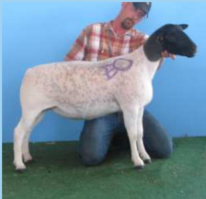
2013 National Champion Dorper Ewe