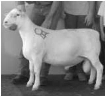
Champion White Dorper Ram Half Circle Six Ranches, Texas