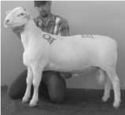
Res. Champion White Dorper Ram Riverwood Farms, Ohio