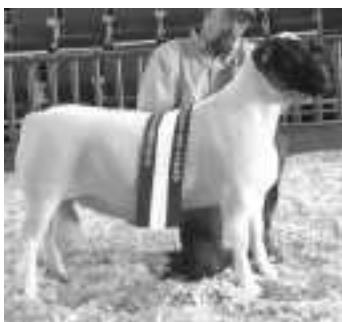
Champion Dorper Ram Riverwood Farms, Ohio