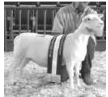
Champion White Dorper Ewe Riverwood Farms, Ohio