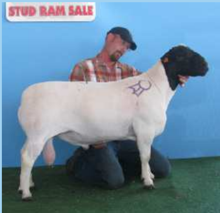
2013 National Champion Dorper Ram