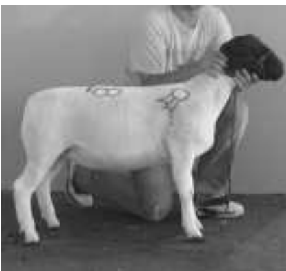
Reserve Champion Dorper Ewe Missouri Dorpers, Missouri