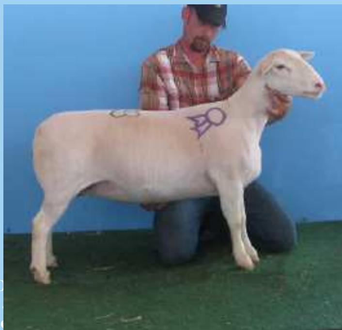
2013 National Champion White Dorper Ewe