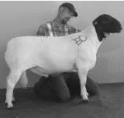
Champion Dorper Ram Riverwood Farms, Ohio

Best Consignment Award was presented to Riverwood Farms of Powell, Ohio.