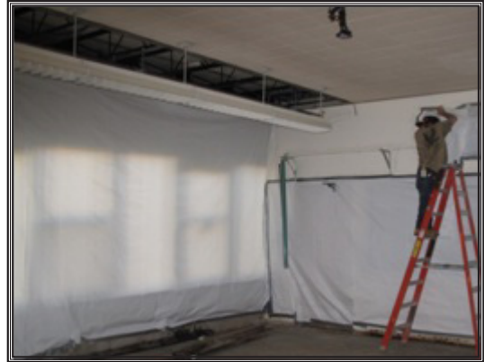
Preparing a classroom to remove asbestos containing floor tile.