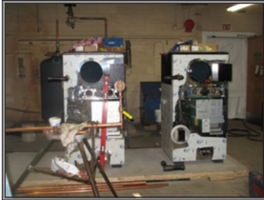
New boilers in all three buildings will increase the efficiency from 75% to over 90%.

Demolition has been completed and contractors are now putting the district back together in time for opening day. By the end of the project, all school buildings will have new heating systems, roofs, and classroom lighting. Other improvements include: upgraded science classrooms, improved drainage, asbestos abatement, and new sidewalks at the high school. We are anticipating a significant reduction in our utility bill next year!