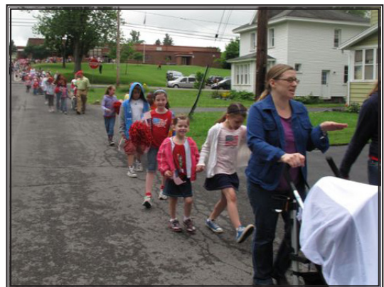
Flag Day Parade 2011