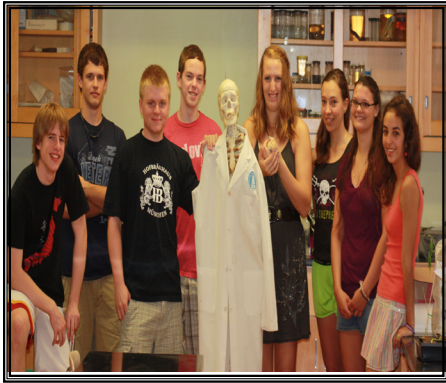
AP Biology Students

The AP Biology students had all their hard work during the year pay off with excellent results on the AP Biology exam, given in May.