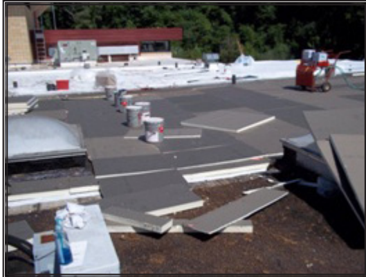
Replacing the roof and increasing the underlying insulation.