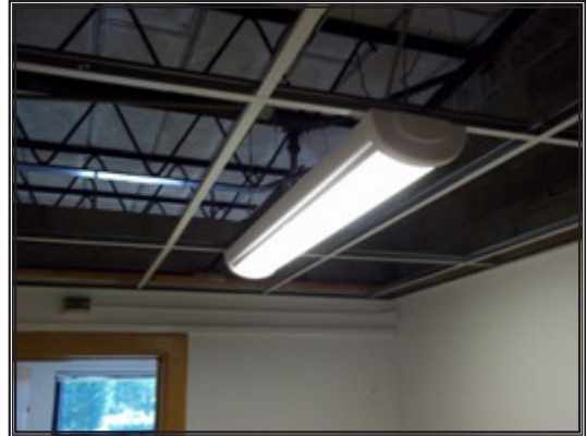
Upgrading to high efficiency lighting.

Please be advised that all of our building's main offices have been temporarily relocated as follows: