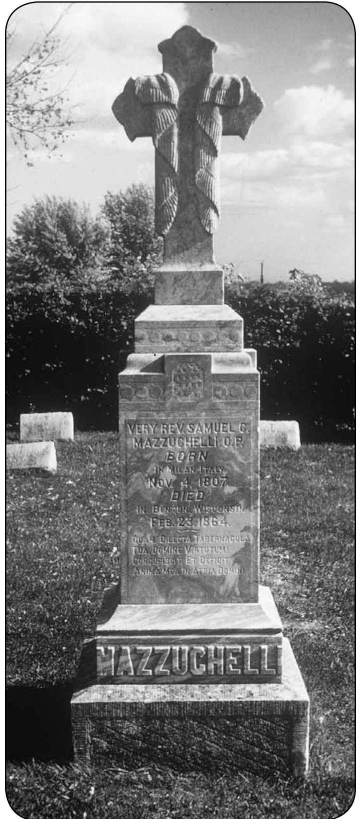
Father Mazzuchelli's tombstone at St. Patrick cemetery in Benton, WI.