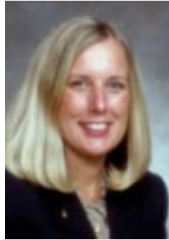
N. Jan Davis, FD01