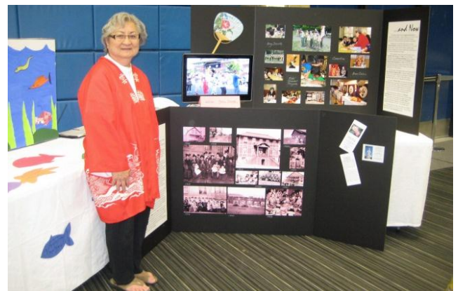
Submitted by Fumiko Groves

Boy Scout Troop 252 In September, Troop 252 started their weekly meetings. The theme for the month of October is Camping/Hiking (Outdoor Skills). In October, we will learn how to build survival kits, make tarp tents, and learn how to survive in the wilderness. The Troop also looks forward to starting the Sangha award class with Rimban Castro. Finally, we plan to have a beef bowl fundraiser on September 30 and October 14 during Chibichan basketball. Gassho, Alex Sakamoto