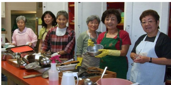
SBBWA members cleaning and organizing the pantry