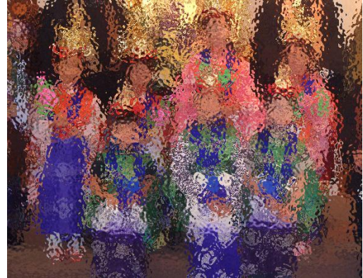
2011 Ochigo participants

You may also contact her at smileyfuji@comcast.net .