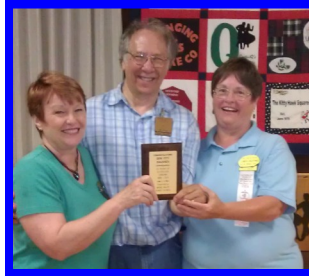
Celebrating 25 years