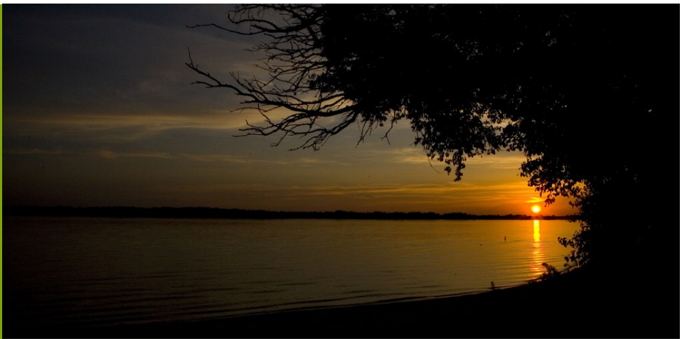
Milford Lake, Kansas - Home of Flagstop Resort & RV Park

A New Ericksonian In-directive Model of Play Therapy