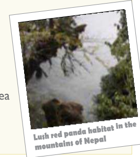
Lush red panda habitat in the mountains of Nepal