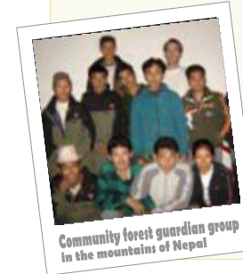
Community forest guardian group in the mountains of Nepal