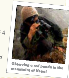
Observing a red panda in the mountains of Nepal