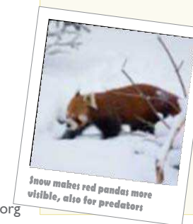
Snow makes red pandas more visible, also for predators