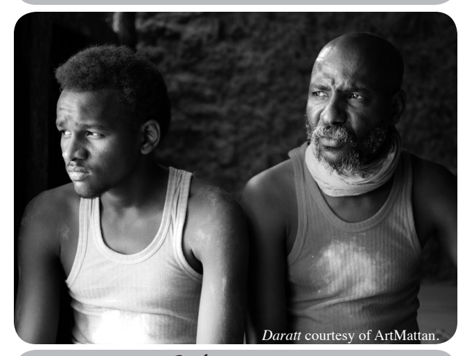
What to do:

Contributions at any level help to defray the costs of projection, rental fees, and shipping so that we can mount ambitious programs that are truly international in scope. Or, if something on our calendar catches your eye, consider sponsoring a specific program or series.